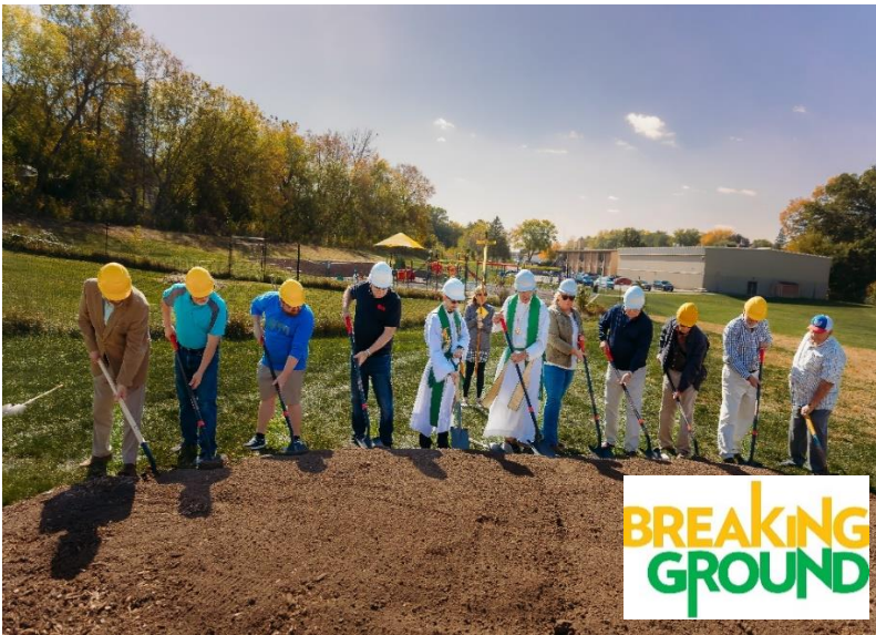
Ground Breaking took place on October 6 th , 2024 at 12:00 noon!